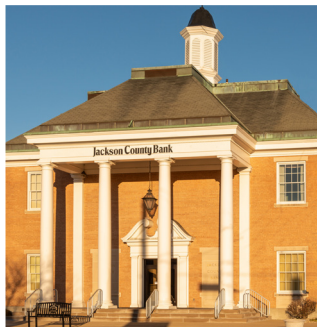
1970 125 S Chestnut Street Seymour