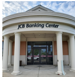
2002 3880 W Jonathan Moore Pike Columbus