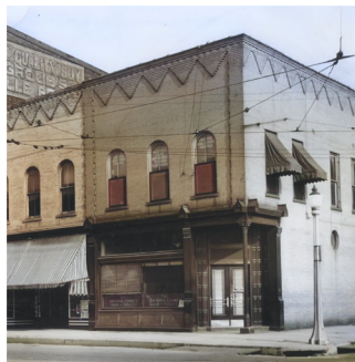
1922 127 W 2nd Street Seymour