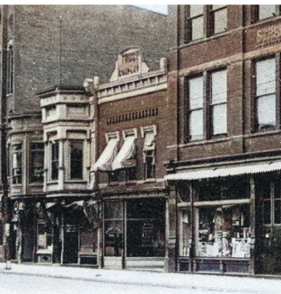
1900 9 N Chestnut Street Seymour