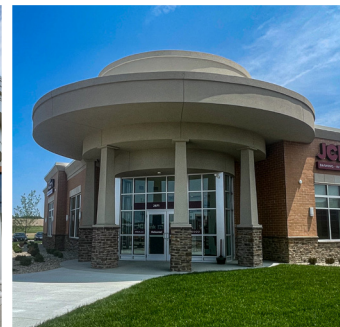
2023 2871 S State Rd 135 Greenwood